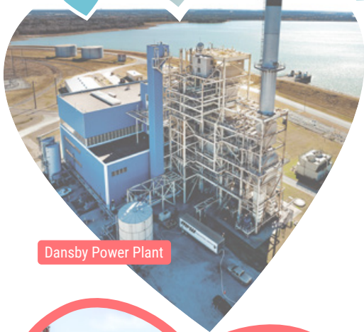
Dansby Power Plant