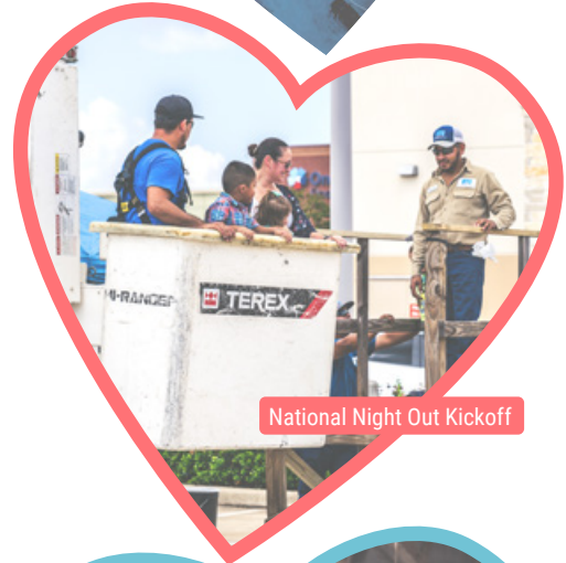
National Night Out Kickoff