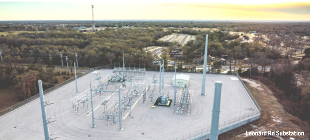
Leonard Rd Substation

The Board approved updates to the BTU Risk Policy as presented by BTU staff.