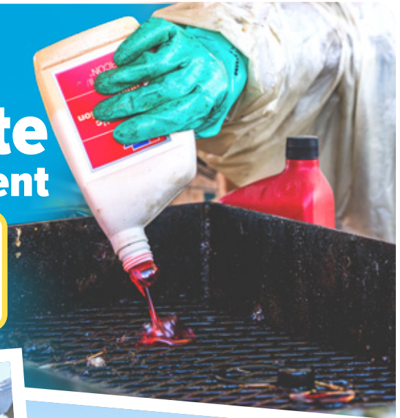
CITY OF BRYAN ©