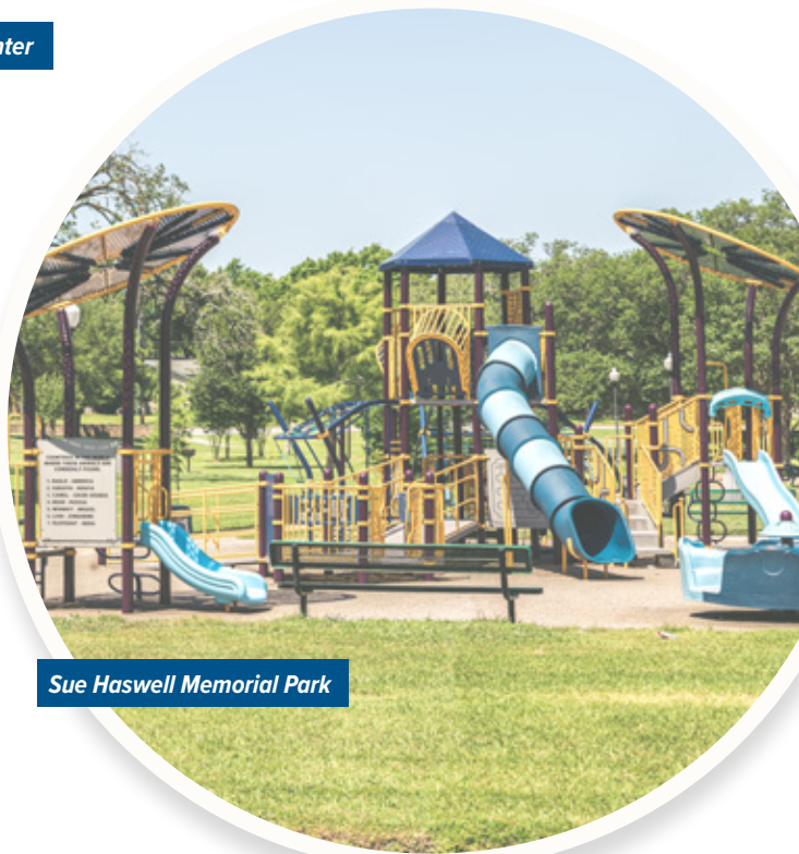
Sue Haswell Memorial Park