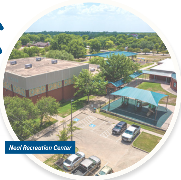
Neal Recreation Center