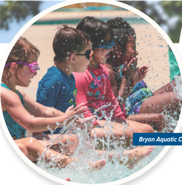
Bryan Aquatic Center