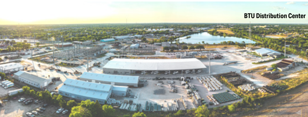
BTU Distribution Center

The Board approved a recommendation to the Bryan City Council for a partial sale of property, formerly the Nall Lane Substation, along William J. Bryan Parkway to TxDOT for a road widening and improvement project.