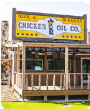
CITY OF BRYAN ©